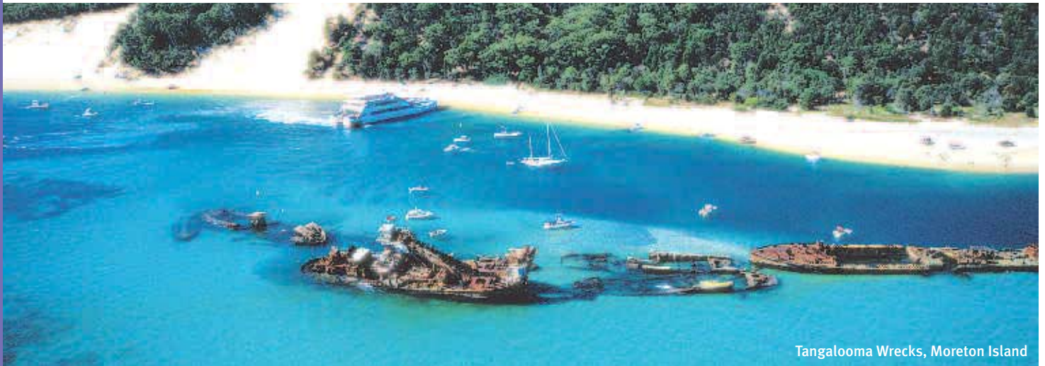
Tangalooma Wrecks, Moreton Island

Follow up your city escape with an island getaway beyond Brisbane. Set out across the bay to Moreton Island. Hand feed wild dolphins and soak up the nature in a place that's almost entirely national park. Get your adventure fix as you toboggan down one of the world's largest sand dunes or dive the Tangalooma Wrecks.