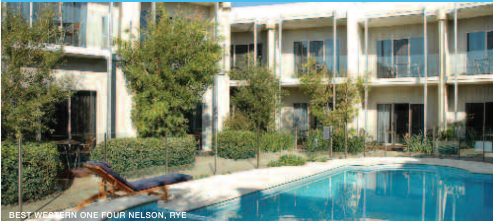
BEST WESTERN ONE FOUR NELSON, RYE