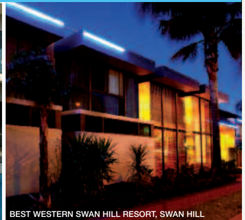
BEST WESTERN SWAN HILL RESORT, SWAN HILL

Best Western Australasia offers a comprehensive hotel pass program giving travellers flexibility and convenience for a pre-booked or 'go-as-you-please' holiday.