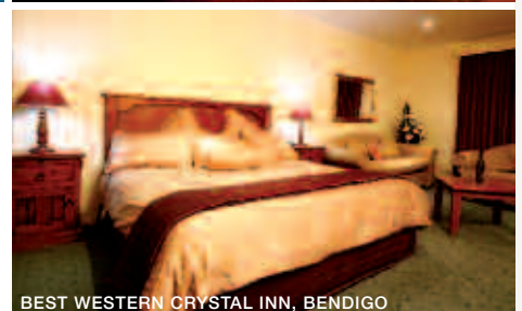
BEST WESTERN CRYSTAL INN, BENDIGO