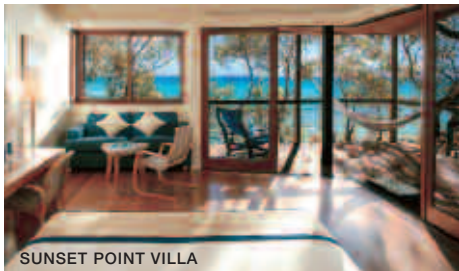
SUNSET POINT VILLA