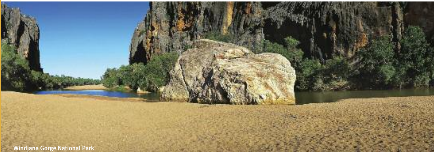
Windjana Gorge National Park

Straddling the Fitzroy River, Fitzroy Crossing acts as a perfect stopover for those exploring the nearby national parks of the Kimberley. Make it your base to explore Tunnel Creek and Windjana Gorge National Parks. Be sure you head to the river, which is legendary for barramundi fishing.