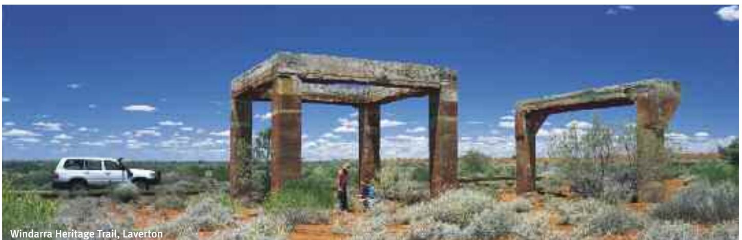
Windarra Heritage Trail, Laverton