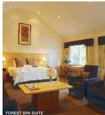
FOREST SPA SUITE