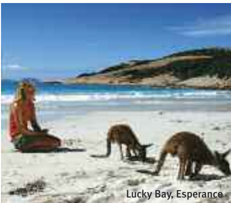
Lucky Bay, Esperance

Esperance, on the shores of Esperance Bay, is a very special part of the coast. From national parks to beaches, you'll never be lost for new terrain to explore. Go swimming and bushwalking in Cape Le Grand National Park, where you might just see kangaroos sunbaking on the beach. There's more scenic wonders off the coast with the 110 islands of the Recherche Archipelago giving the town its title 'Bay of Isles'. Take a cruise around the archipelago, with a stop at Woody Island for a day or two of bushwalking and snorkelling.