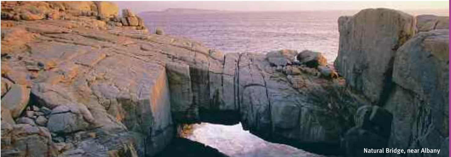
Natural Bridge, near Albany