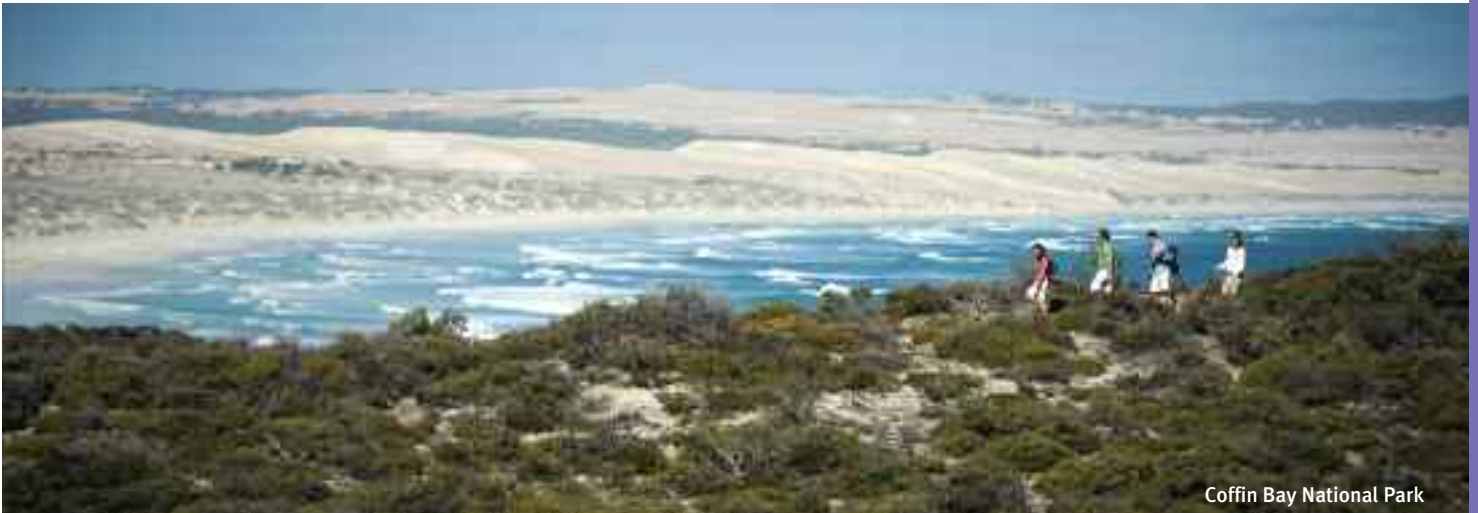
Coffin Bay National Park