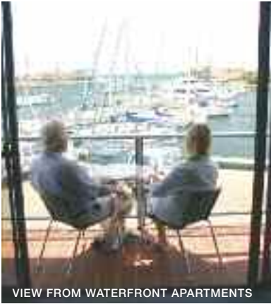
VIEW FROM WATERFRONT APARTMENTS