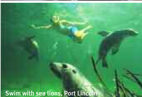
Swim with sea lions, Port Lincoln