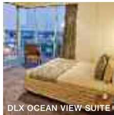
DLX OCEAN VIEW SUITE

Contemporary and stylish in a relaxed coastal setting, Port Lincoln Hotel features stunning views over Boston Bay.