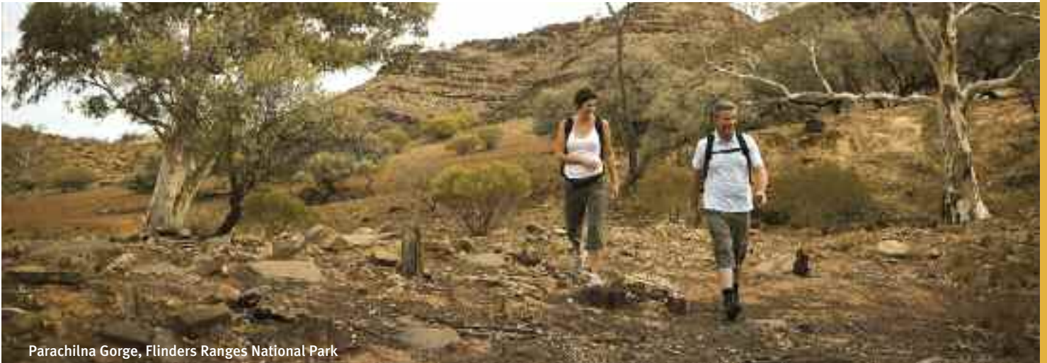
Parachilna Gorge, Flinders Ranges National Park