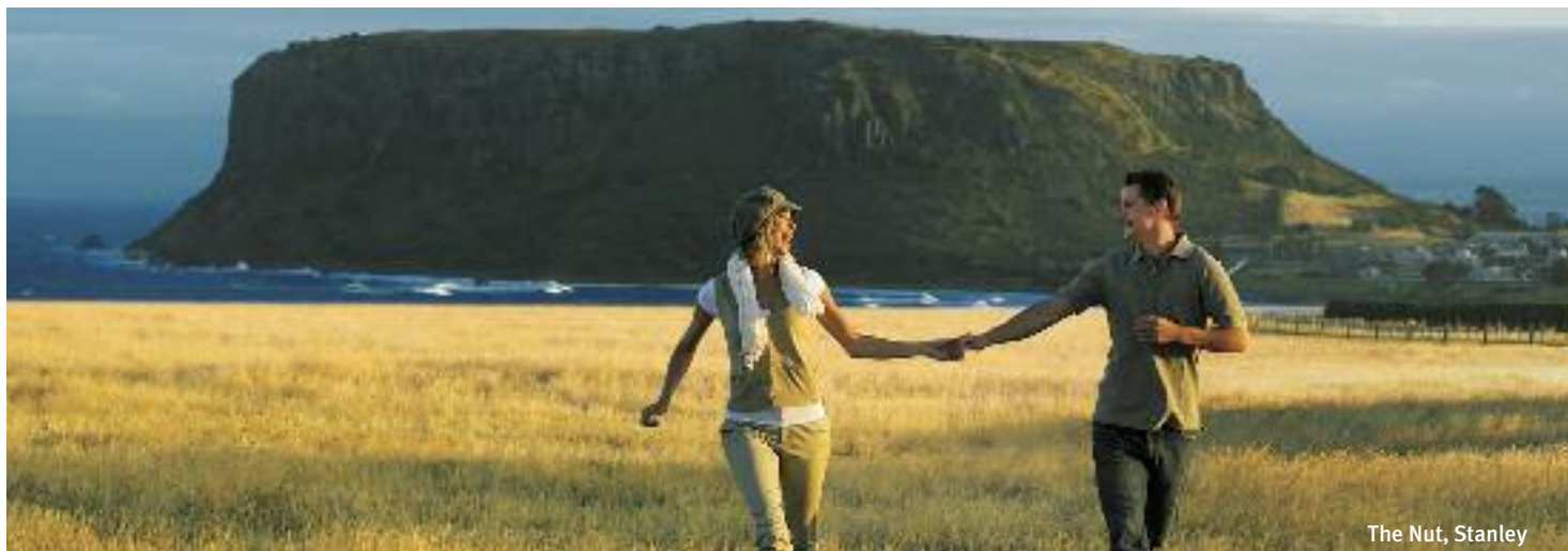
The Nut, Stanley