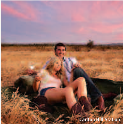
Carlton Hill Station