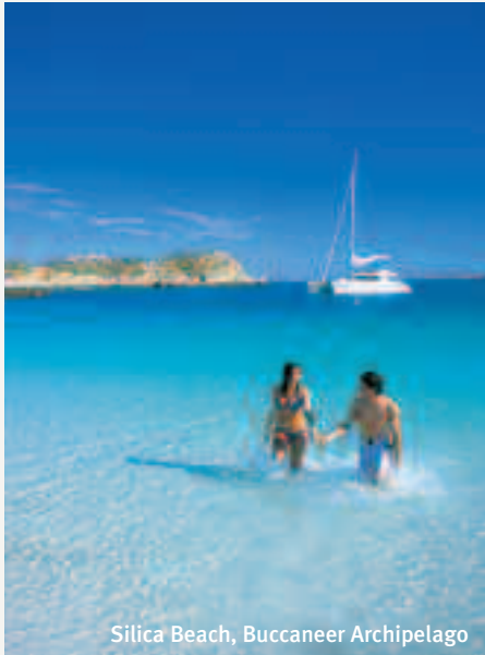
Silica Beach, Buccaneer Archipelago