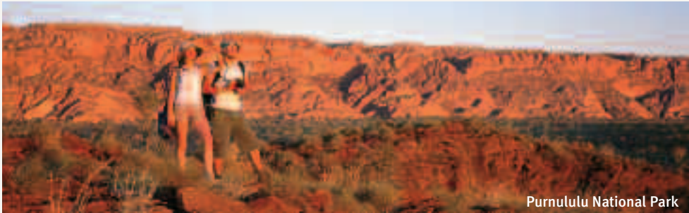
Purnululu National Park