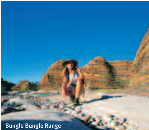
Bungle Bungle Range