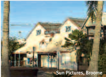
Sun Pictures, Broome