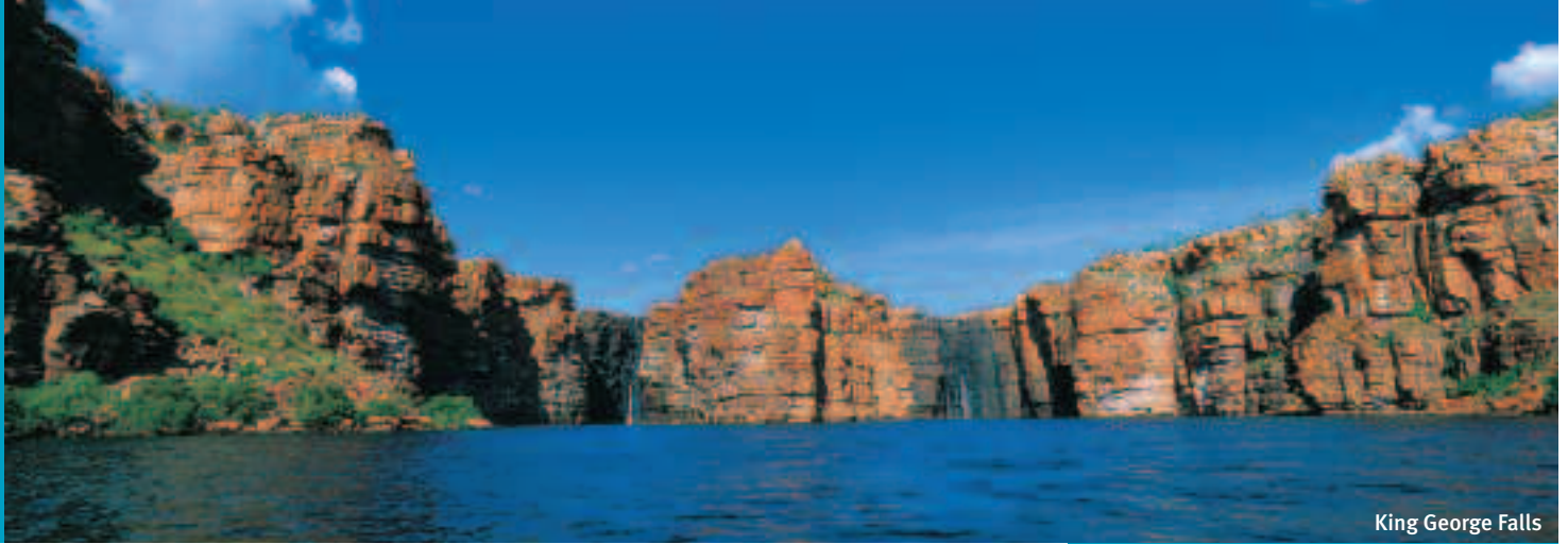
King George Falls

There's so much untouched wilderness to discover in the Kimberley region and the coastline is no exception. What better way to explore this pristine environment than with an extended cruise.