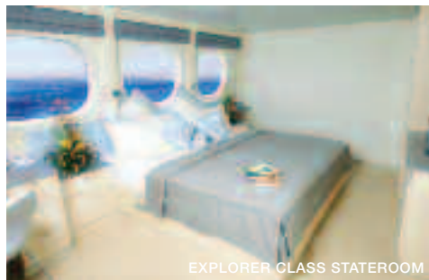
EXPLORER CLASS STATEROOM