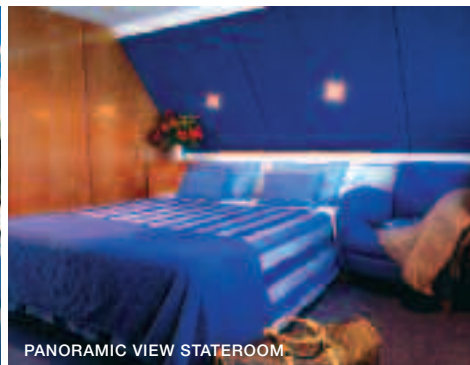
PANORAMIC VIEW STATEROOM